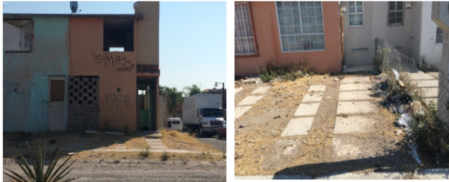
Figures 3 and 4. Entropies in the rationalist-progressive occupancy in La Azucena Source: Author's own elaboration. Fieldwork research, december 2016.

available information, the area with more population corresponds to the main roadways, in contrast with those located near Las Pintas canal, which are less inhabited areas (figures 3 and 4).