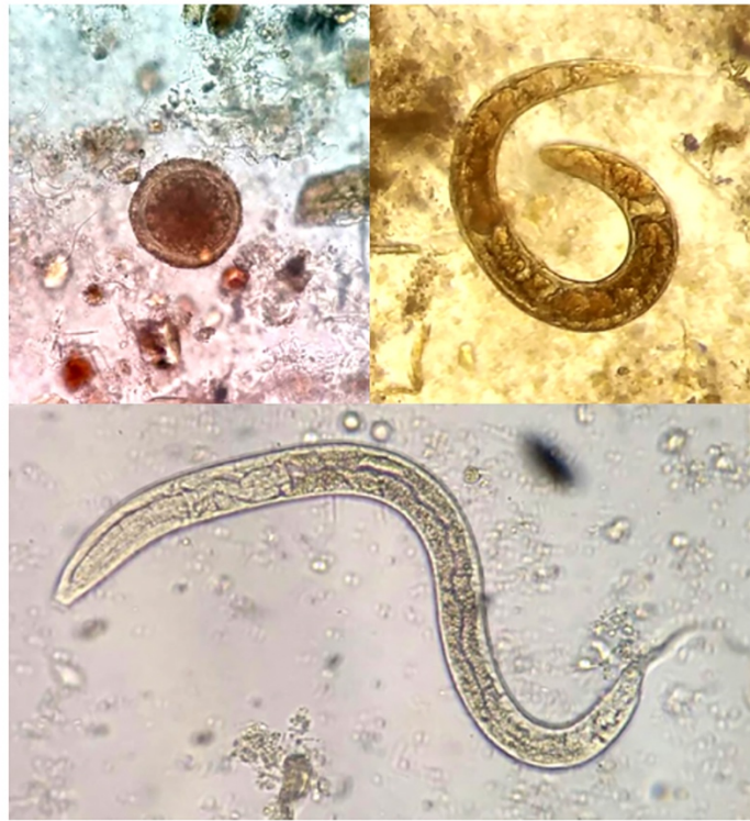
Figure 2: Photomicrograph of parasitic forms found in the study, stained with iodine solution for parasitology. A Toxocara canis egg B Strongyloides sp. larvae C Ancylostoma sp. larvae.