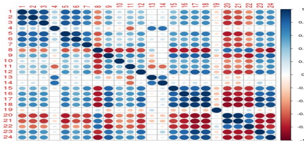
Figure 1. Correlogram of selected subjective and objective indicators for Mexico, 2014.

Keys: 1. Life in general; 2. Health; 3. Achievements; 4. Satisfaction with personal security; 5. Material needs satisfied; 6. Excellent living conditions; 7. Wouldn't change anything if born again; 8. Perception of poverty; 9. Perception of corruption; 10. Criminals go unpunished; 11. Insecurity; 12. Narcotraffic; 13. Perception of local security; 14. Perception of municipal security; 15. Health Indicator IDH; 16. Education Indicator IDH; 17. Income Indicator IDH; 18. IDH; 19. GINI; 20. % population with at least one social deprivation; 21. % population without access to social security; 22. % population in rural localities; 23. Households with access to internet; 24. Salaried employment.