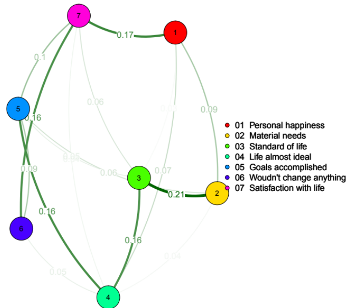
Figure 4. Graph of partial correlations of Mexican life satisfaction according to BIARE data (second block).

Another strong link is between nodes 6 wouldn't change anything and 7 satisfaction with life , as one would expect. The link between nodes 4 and 5, life almost ideal and goals achieved , respectively, is natural; and although in the model there is no in-built causality, one is tempted to suggest that a life almost ideal is surely related to meeting one's goals. Nodes 2 and 3 are also naturally connected because satisfying material needs requires running a household, which improves the members' standard of living.